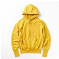
Vintage Yellow Top Gray