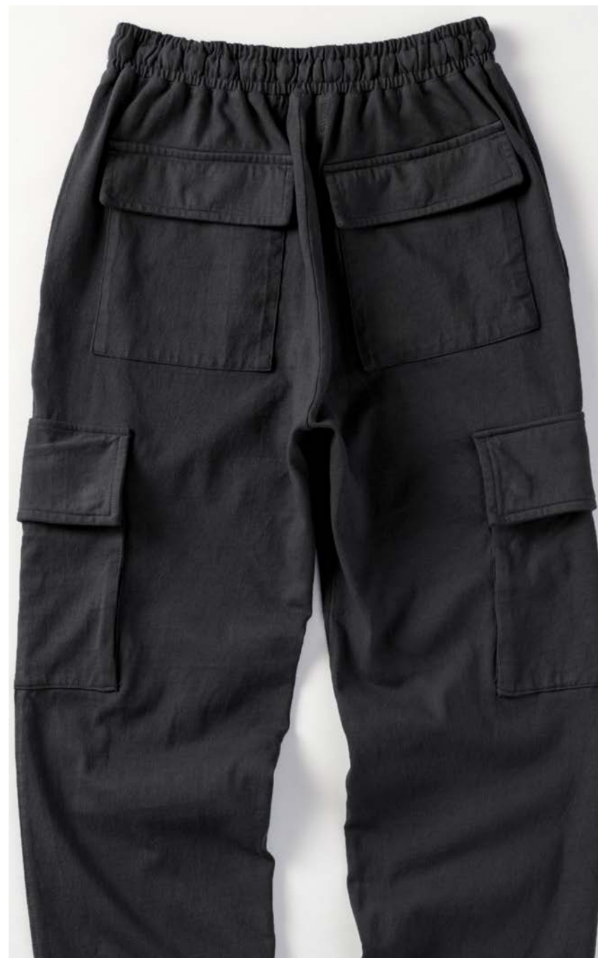
Light Basic Cargo Pants